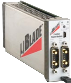
Panther™ 760 & 380 Power Module